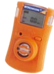
Portable Gas Detector

Crowcon manufacture a complete range of both fixed and portable gas detection equipment for personal and plant protection against gas hazards across the globe. Based on a solid foundation of expertise in understanding of the core physics and chemistry of gas detection, Crowcon works closely with international bodies to ensure products are designed to industry leading equipment certification and performance standards.