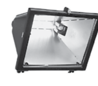
Copper Crouse-Hinds Light