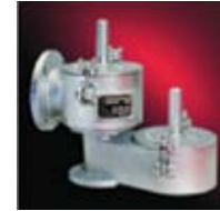
Pressure Vacuum Vent

Protectoseal is the leading global manufacturer of vapour and flame control equipment for storage tanks. Since inception in 1925, Protectoseal has manufactured the highest quality products with a continuing commitment to "Safety Without Compromise".